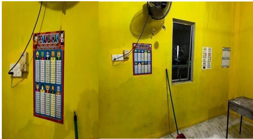
Figure 1. Study room