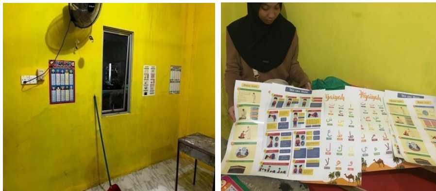
Figure 4. Poster Attachment

To enhance the classroom atmosphere and engage the children, the Community Service Program team posted several educational posters on the classroom walls. These included addition posters, daily prayer posters, and illustrated posters to support the children's learning process.