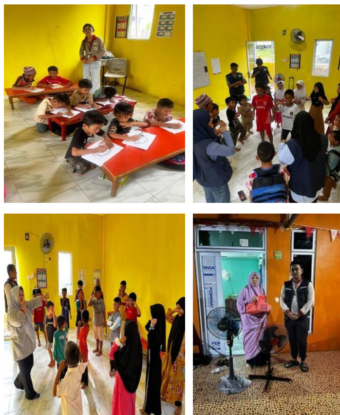
Figure 6. Handing over fans to community leaders (ustadz or ustadzah)

The children have begun using the renovated room for learning activities. With newly repaired desks and educational posters throughout the room, the learning process has become more conducive, engaging, and interactive.