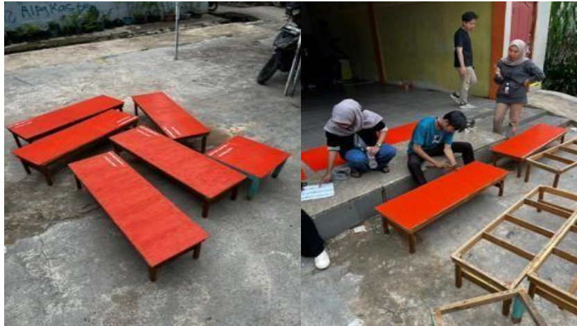
Figure 3. Table Assembly