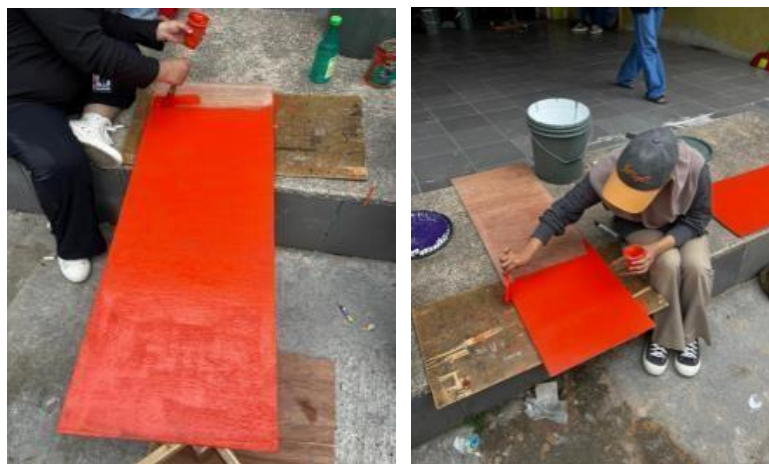
Figure 2. Table painting

After the table frame was repaired, the tabletop was painted a bright red. This process was conducted collaboratively by the Community Service Program members.